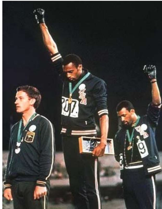
Figure 14.2 Sport was being used as a vehicle for social change and to generate awareness when Tommie Smith and John Carlos raised their fists on the medal podium as a symbol of racial solidarity at the 1968 Olympics in Mexico City.

As a medium for social change, sport has become interwoven with politics and the fight for equality and tolerance. An example of using sport as a political vehicle is the U.S.-led boycott of the