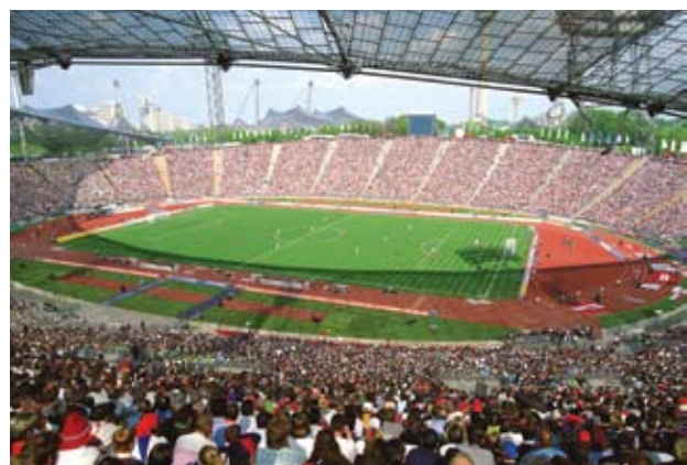
Figure 14.1 Current estimates place sport as the 6th largest industry in the United States, bringing in $213 to $410 billion USD depending on the factors considered.

The sport industry has been segmented in various ways to help differentiate the multitude of areas in which sport management principles might be applied. Some of these areas include school and college sports programs, professional sports, amateur sports organizations (e.g., the International Tennis Federation), private club sports, commercialized sports establishments (e.g., bowling alleys), facilities (arenas, stadiums,