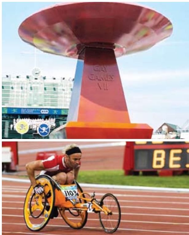
Figure 14.3 Sport can help bring awareness to many types of social injustice such as homophobic beliefs and the segregation of persons with disabilities.

Similarly, sport has provided an arena for raising awareness about other types of social injustice, including homophobic beliefs and segregation of persons with disabilities. Events such as the Special Olympics, the Paralympic Games, and the Gay Games have experienced significant growth, popularity, and commercial success and bring well-deserved attention to these members of society (Figure 14.3).